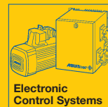
Electronic Control Systems