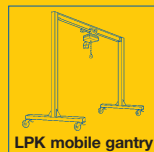
LPK mobile gantry