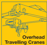
Overhead Travelling Cranes