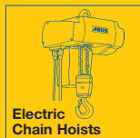
Electric Chain Hoists