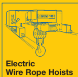
Electric Wire Rope Hoists