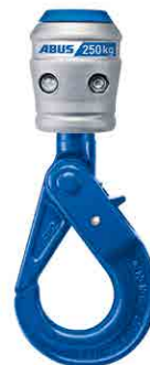
Safety load hook