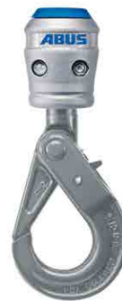
Safety load hook