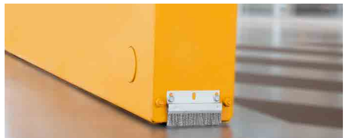
Floor rollers without guide rails