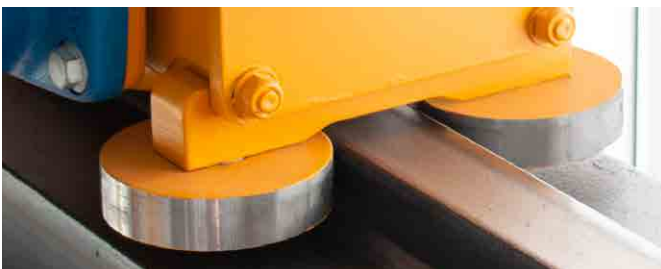
Guide rollers on the high level crane rail